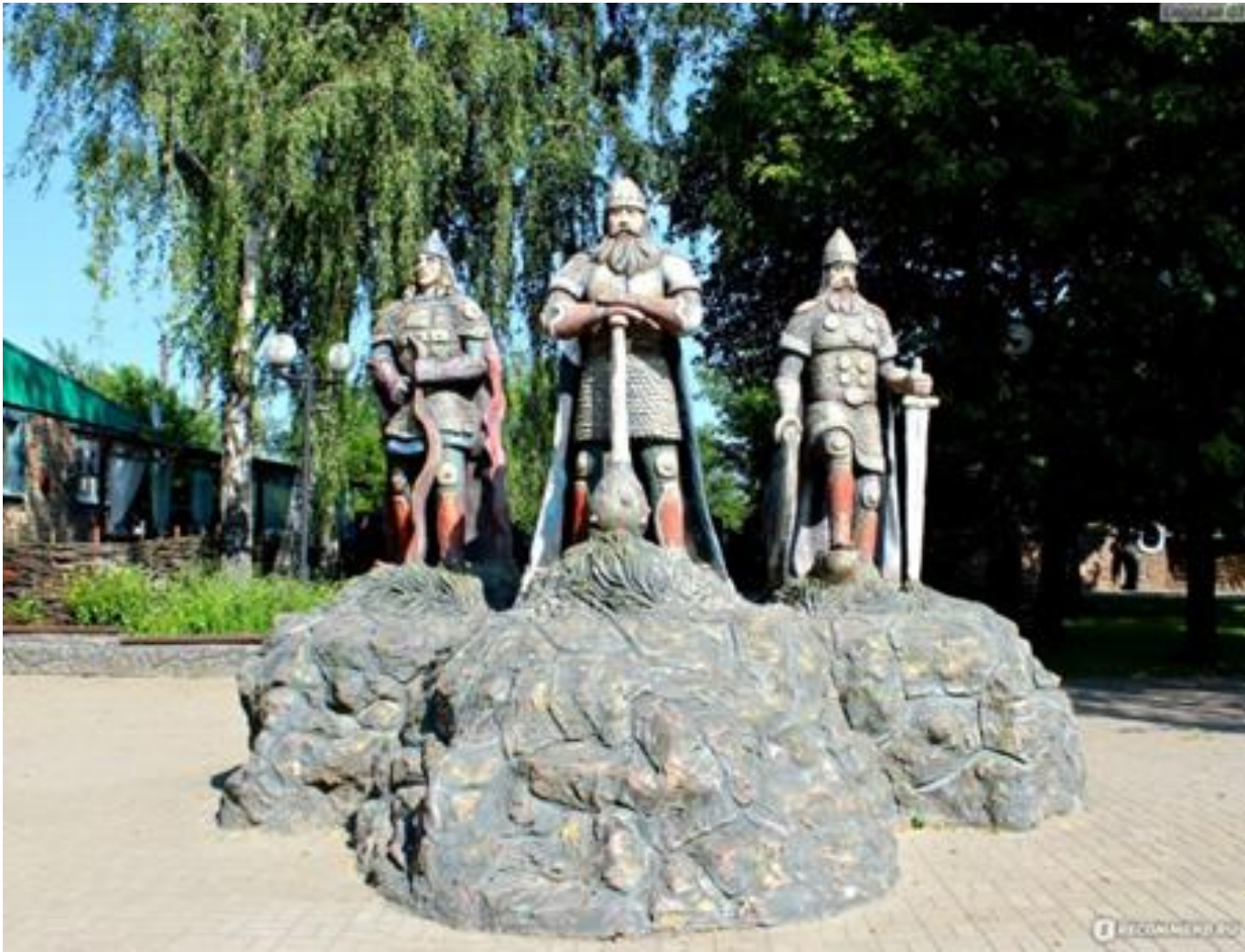
The park "Three Heroes"