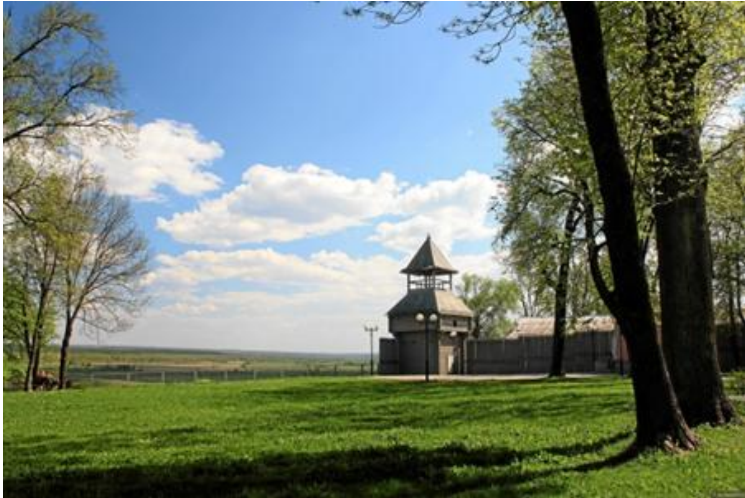
The fortress tower in the city park