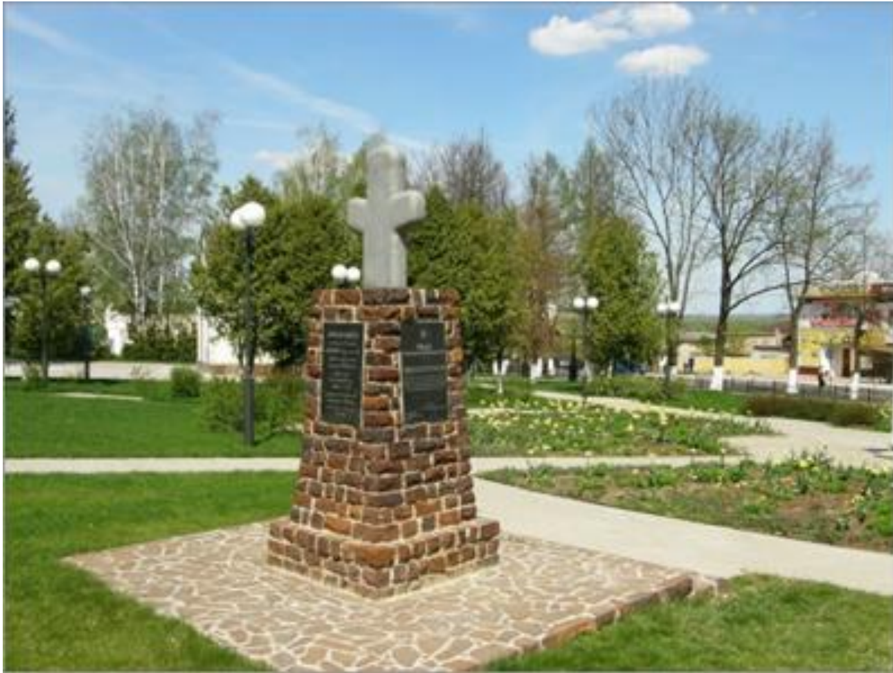
The ancient memory cross