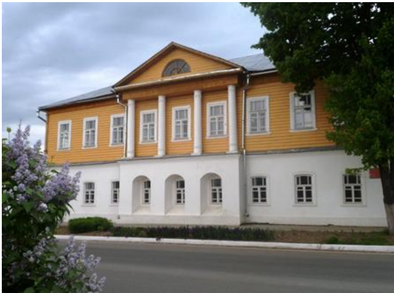
The local history museum "House of Tsyplakov"